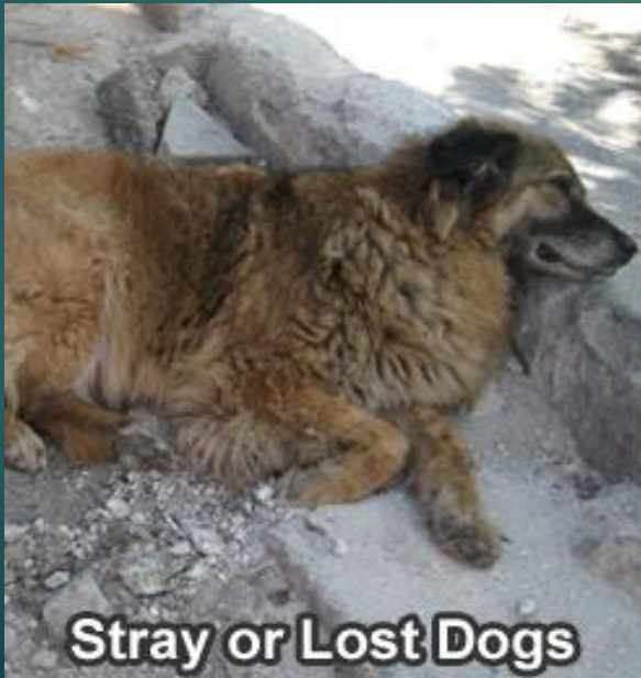
Stray or Lost Dogs