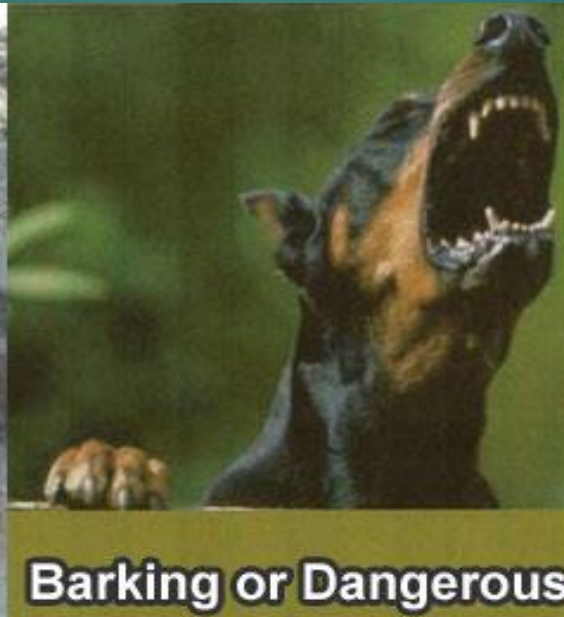
Barking or Dangerous